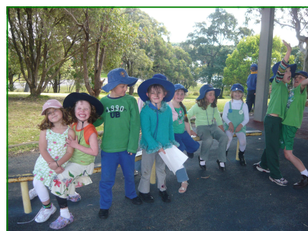
MEPS going green!