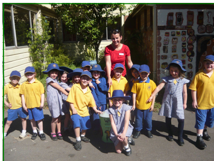
KW says "Keep it Clean, and Keep it Green!"