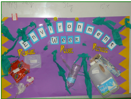
1-2H Recycling Poster