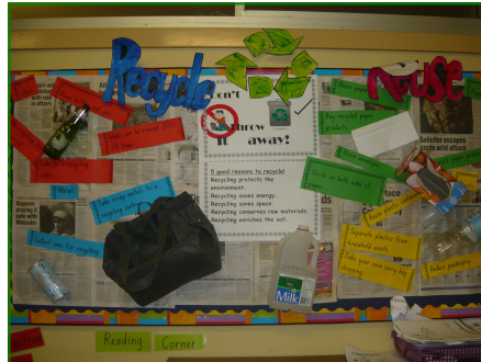
1-2A Recycling Poster