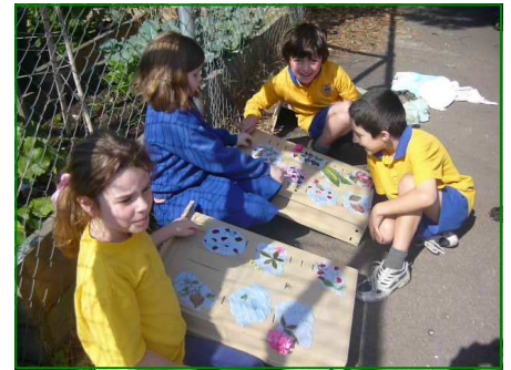
Making recycled paper for cards