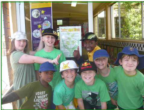
Green Kids celebrating Green Day